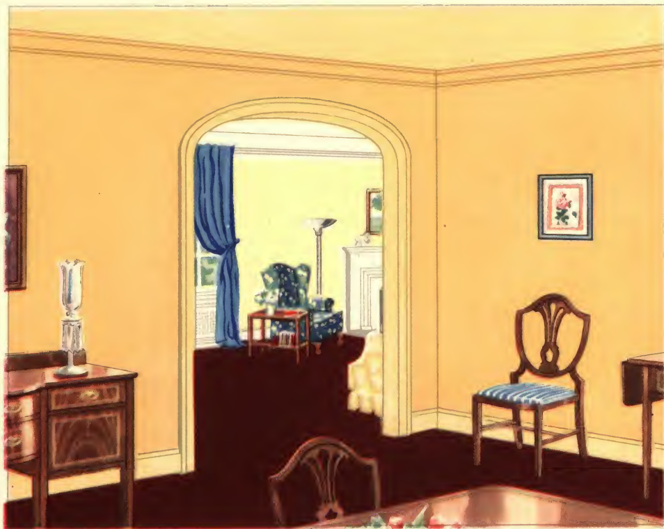
DINING ROOM—CEILING: Ecru Sani-Flat or # 14 Old Ivory Muresco. WALLS: Buff Sani-Flat or # 27 Buff Muresco. WOODWORK: Ivory Utilac Enamel.

adjoining has a wall of Adam Green Sani-Flat, or Muresco—an example of thoroughly modern COLOR-STYLING .