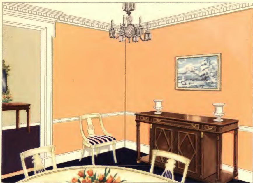
DINING ROOM — CEILING : White Sani-Flat or White Muresco. WALLS : Apricot Sani-Flat or #3 Peach Muresco. WOODWORK and CHAIR RAIL : White Utilac Enamel. TABLE and CHAIRS : White Utilac Enamel Antiqued. HALL seen through opening. WALLS : Adam Green Sani-Flat or #5 Adam Green Muresco.

As a matter of fact, being modern people living in a modern age, you will feel far more pride in a house of modern character and charm than you will in a throw-back to other times and conditions.