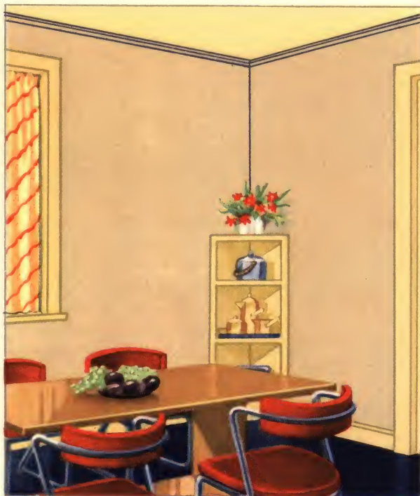
DINING ROOM—CEILING: Ecrú Sani-Flat or # 14 Old Ivory Muresco. WALLS: Putty Sani-Flat or # 9 Putty Color Muresco. TRIM: Ivory Utilac Enamel.

an individual consultation service, without obligation, that is helping to COLOR-STYLE thousands of homes and glad of the opportunity to do so. Whatever your problem is, write it to Betty Moore and a clever solution is bound to ensue. Now, just for the fun of it, let us explore one of these newly COLOR-STYLED houses and see what the modern use of color can do to make it more charming and livable upstairs and down.