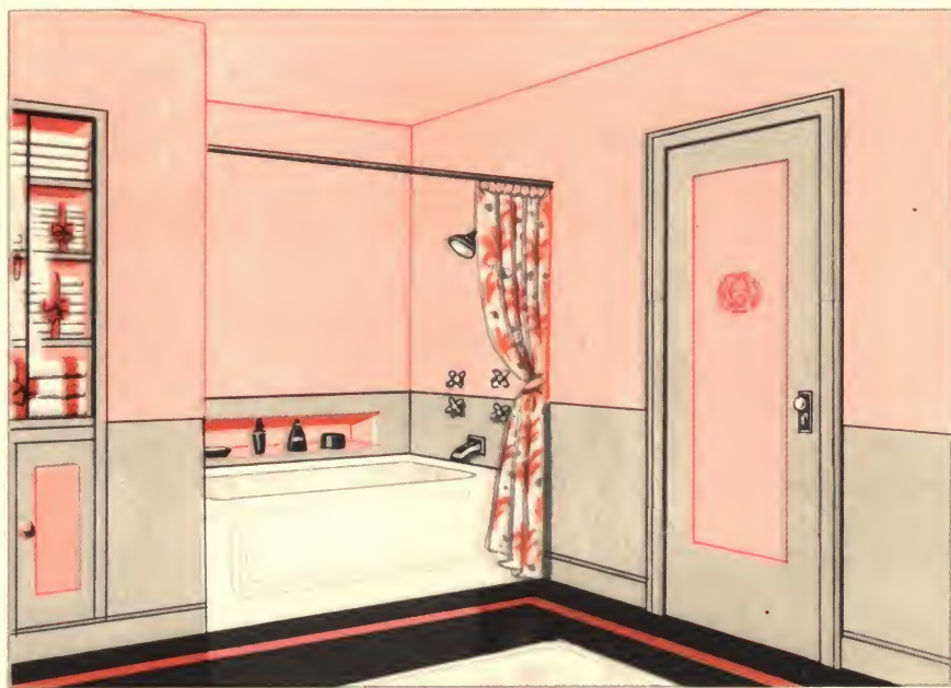
BATHROOM—CEILING, DOOR, UPPER WALLS: Equal parts Pink and White Utilac Enamel. DADO and WOODWORK: Light Gray Utilac Enamel. FLOOR: Black Utilac Enamel with Pink Utilac Enamel stripe.

Take, for instance, the attractive little house which was chosen as our first example of COLOR-STYLING on the second page of this book. Nothing very sensational there, and yet somehow it strikes a definite note—and an appealing one. Silver Gray shingled roof, White body and trim,