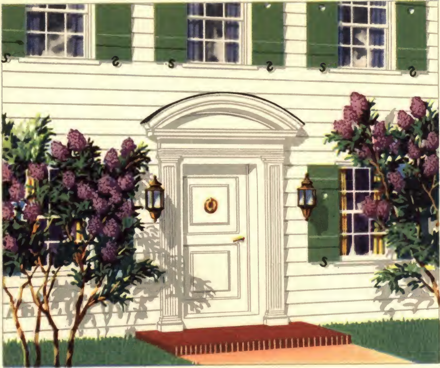
BODY and DOOR: Outside White Moore's House Paint. BLINDS: Blind and Trellis Green Medium.

of the character and purpose of each room—a sample of what can be done in your home to make it once more livable and more in keeping with your life and times.